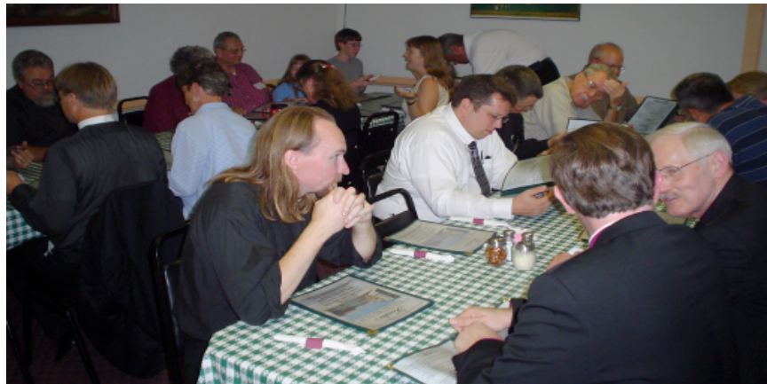
Dinner at Frenkies following the Colloquium