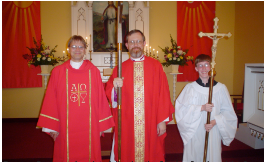
Deacon, Pastor and acolyte following the Closing Service of the Synod