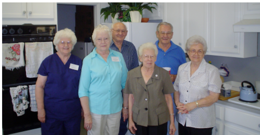
Some of the ladies and gentlemen who took care of our visitors.