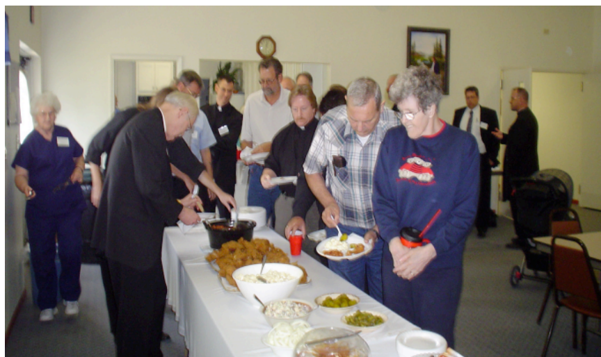
Pastors and laity enjoying one of meals prepared by the Women's Guild